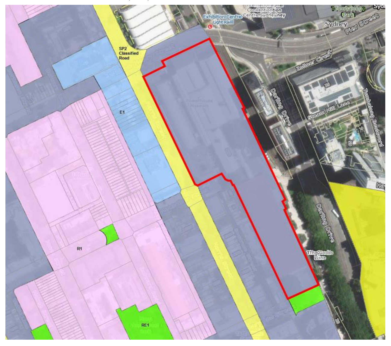
Figure 3. Extract from Zoning map in the SLEP 2012 showing zoning controls.

The Powerhouse Museum Lot and DP boundary and proposed SLEP 2012 mapped heritage boundary is located within the MU1, Mixed Use Zone. It is abutted by a Classified Road (SP2) to the west and Public Recreation (RE1) area to the south.