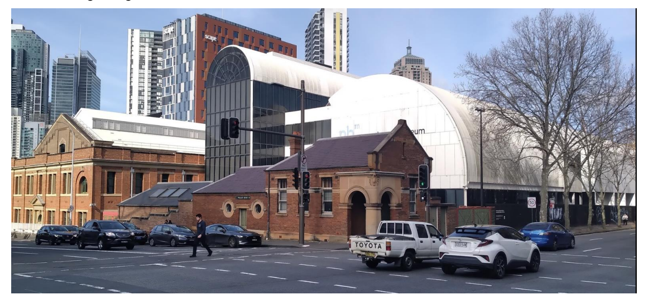
Figure 2. The Powerhouse Museum at 500 Harris Street, Ultimo

The Powerhouse Museum was developed during the 1980s as premises for Museum of Applied Arts and Sciences (MAAS), which maintains a diverse collection estimated at 500,000 items/objects. The Museum is owned by the NSW Government and operated and maintained by the NSW Minister for the Arts and the Trustees of MAAS. It was formally gazetted on the NSW State Heritage Register in 2020. It closed in 2024.