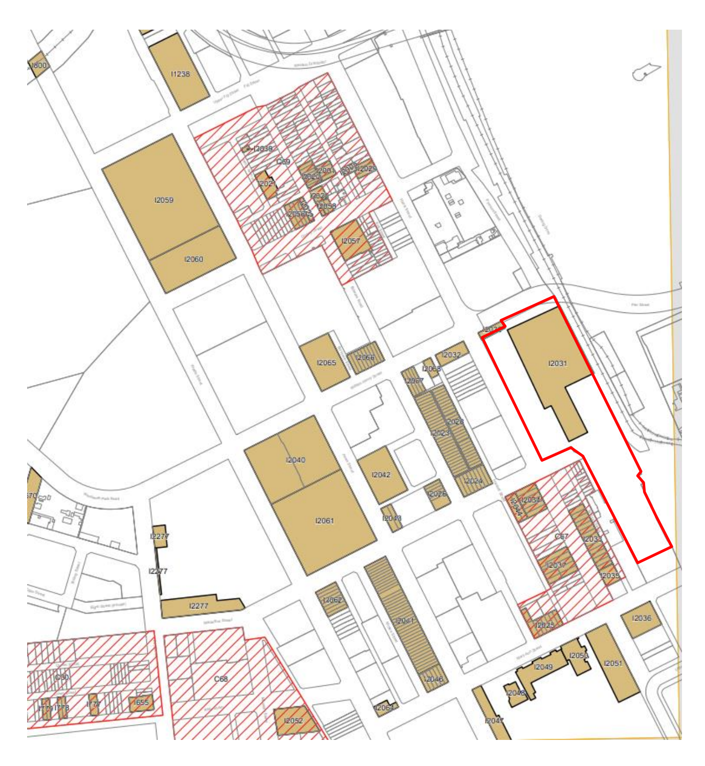
Figure 4. Extract from the SLEP 2012 Heritage Map (HER_008) showing heritage items adjacent to, and within, 500 Harris Street, Ultimo (outlined in red).